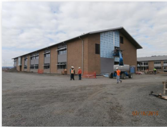
South Classroom wing

Additional photos available via web camera access: www.dwpwebcams.com/whs/desktop.htm