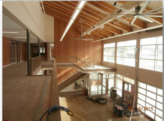
North Shared Activity Area