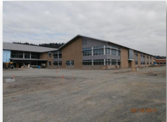
Main Entry and Library