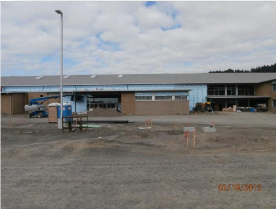
Main Entry and Gym Entry