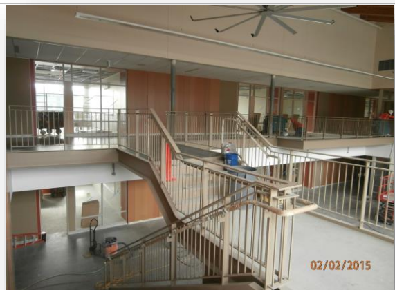
South Shared Activity Area