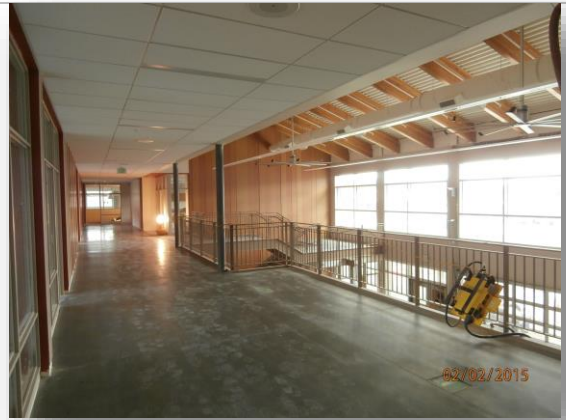
Upper floor at North Classroom Wing