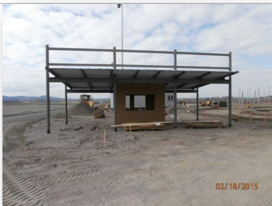
Ticket Booth at Grandstand