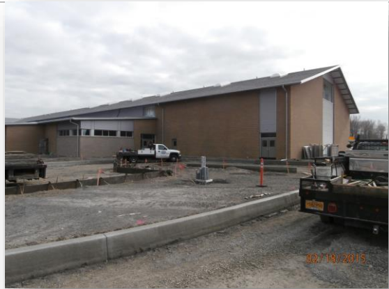
Aux. Gym and Training Room