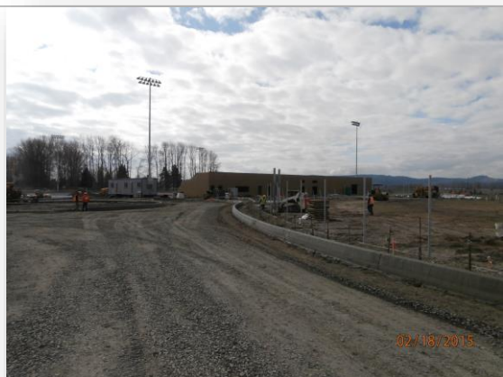
Curb and road base construction NW parking area