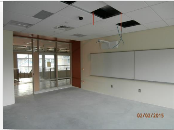
Typical Classroom – North Classroom Wing