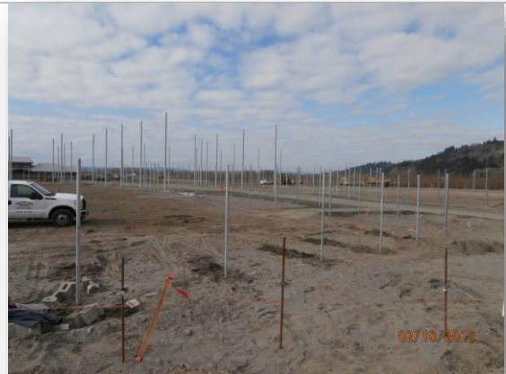
Baseball and Softball fencing