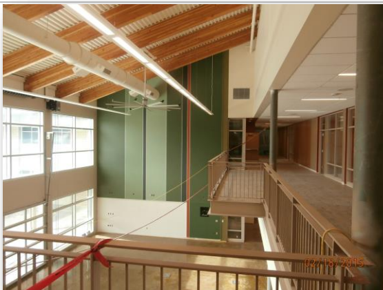
North Shared Activity Area