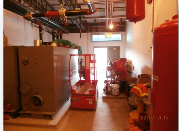
Fire Sprinkler Riser Room