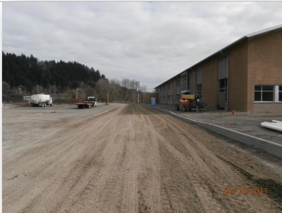
Curb and road base construction North Parking area