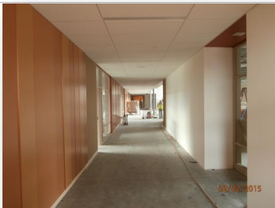
South Classroom Wing corridor